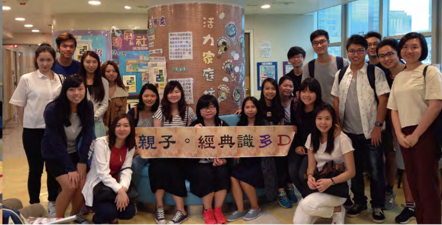
香港理工大學中國文化系師生為家長舉辦「親子經典識多D」工作坊。 Department of Chinese Culture of The Hong Kong Polytechnic University conducted parenting workshop to parents through learning from classical Chinese literatures.

互動，一同走過「老師—學生—家長—孩子」這文化傳承的學習歷程，讓家長代入子女的心境，增進親子關係。計劃反應理想，參與的家長都十分認同向兒童灌輸家庭的核心價值，他們相信給孩子培育這內在品德定能讓孩子一生受用。