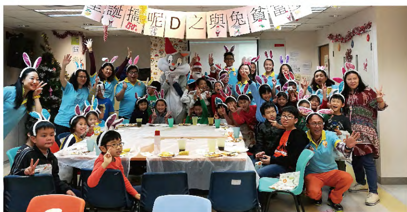
蘇豪香港扶輪社與活力家庭坊一起為「小白兔信箱服務」的兒童參加者籌辦貧富宴活動。 Rotary Club of Soho Hong Kong and Family Energizer (Integrated Family Service) jointly organised ‘Hunger Banquet’ for the children participants of ‘Bunny Mail Service’.

Number of new arrivals in Kwun Tong is the top of other districts in Hong Kong. Besides supporting new arrivals to integrate into society, we also render services to take care of their mental health. Sponsored by the Kwun Tong District Council, our Family Energizer (Integrated Family Service) launched a scheme named ‘Let’s Learn Life Skills Together’ last year to release participants’ life stress, widen their exposure and facilitate social inclusion. The project had two modules: ‘gardening therapy’ and ‘life-and-death education’. While ‘gardening therapy’ made use of various gardening activities, such as cultivation of grass-headed dolls, combination of potted plants, and tasting of herbal meals, to help participants to be aware of their psychological wellness, relax, and learn stress management, ‘life and death education’ combined artistic creation, experiential learning activities and tea gathering to guide participants to rethink their attitudes on death, listen to life stories of other people, as well as learn to live in the present and cherish life.