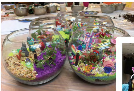
「愛•園美」園藝靜觀家長及兒童組製成品—「組合盆栽」。 Masterpieces of parent and children in horticultural and mindfulness groups.

觀塘區的新來港人士數目為各區之冠，中心的服務除了協助他們融入社區，關顧他們的精神健康亦同樣重要。我們去年獲觀塘區議會贊助推行「共賞生活學堂」計劃，協助新來港家庭紓緩生活壓力，擴闊眼界，促進社區共融。計劃包括「園藝治療」及「生死教育」兩部分。前者藉著如培育草頭娃娃、組合盆栽及品嚐香草美食等活動，讓他們從照顧植物進一步關注自己的心理健康，參加者從中亦得到鬆弛和減壓的機會。而「生死教育系列」結合藝術創作、體驗活動和茶聚，讓參加者認識自己對死亡的觀念，聆聽不同人的生命故事，藉此反思生命的價值，並學習活在當下，珍惜生命。