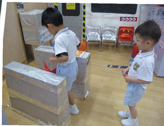
老師配合單元主題製作的港鐵車廂。 The MTR train decorated by teacher to tie in with the themes of the module.